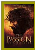
The Passion of the Christ