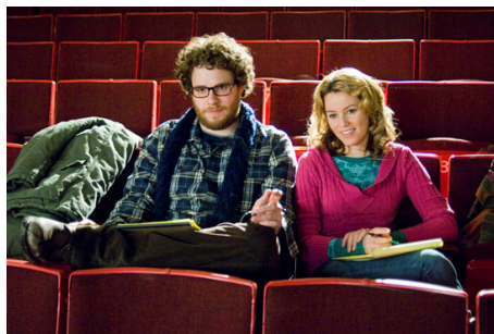
Seth Rogen and Elizabeth Banks as Zack and Miri, 2008

Zack and Miri was released on October 31, 2008. Zack and Miri (Seth Rogen and Elizabeth Banks) are "two lifelong platonic friends who are deep in debt and enlist the help of their pals to make a porno movie for some quick cash." To view the film's trailer visit zackandmiri.com .